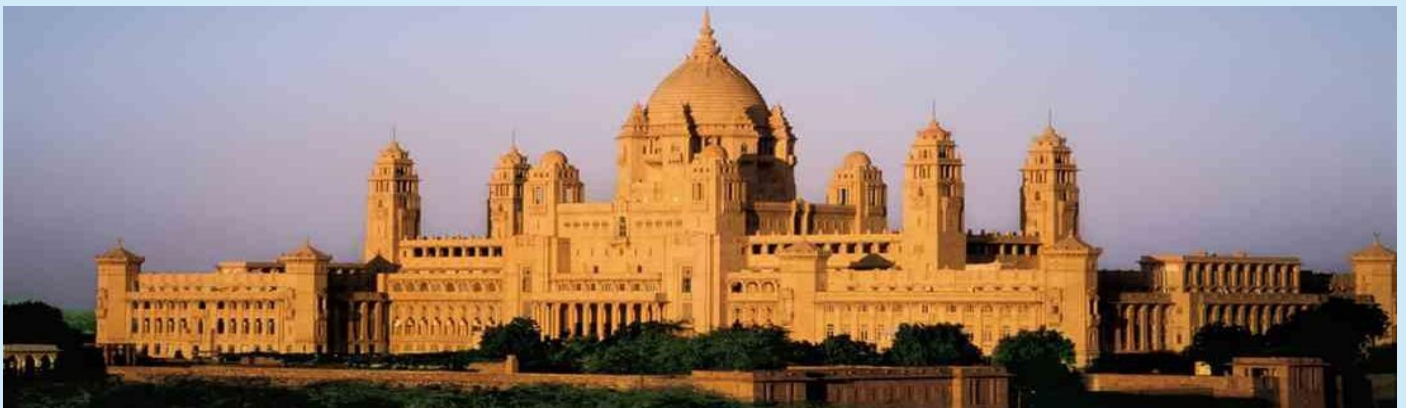
Umaid Bhawan palace

Jodhpur is a very popular tourist destination. The landscape is scenic and mesmerizing. The city has many beautiful palaces and forts such as Umaid Bhawan Palace, Clock Tower and markets, Kaylana Lake, Jaswant Thada, Mehrangarh Fort, Raia ka Bag Palace, Government museum and its beautiful Umaid garden.