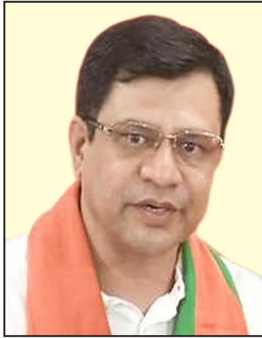
Er. ASHWINI VAISHNAV Union Cabinet Minister Govt. of India

Er Ashwini Vaishnav born at Jodhpur, graduated from MBM Engineering College (JNV University) Jodhpur in 1991. He obtained his B.E. Degree in Electronics and Communication Engineering with Gold Medal. He did his Masters Degree from IIT Kanpur before cracking IAS in 1994 with an all India rank of 27. He joined Indian Administrative Services in Odisha cadre and worked extensively in Odisha. His Exemplary Services were recognised by then PM Shri Atal Bihari Vajpayee and in 2003 he moved to Delhi to join as Dy. Secretary in PMO. In 2004 when Shri Vajpayee lost power, he continued as his Private Secretary. In 2008, Vaishnav left for USA to do his MBA from Wharton School, University of Pennsylvania.